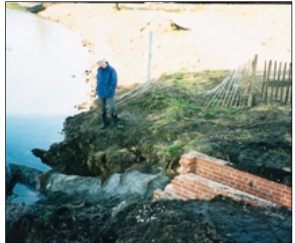
New outfall chamber under construction

The outfalls appear to be working effectively. The level of maintenance required has not been as frequent as previously envisaged and is now undertaken once a year. No blockages by siltation of the river bed have occurred. The outfalls are now virtually invisible.