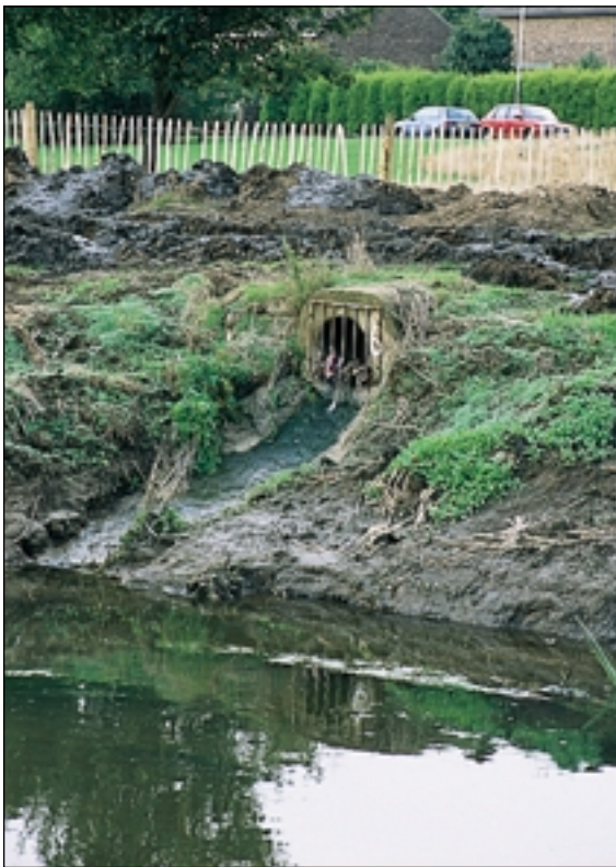
Typical outfall before replacement

COST – £15k - cross connection survey, £23k - renewal of 13 headwalls, construction of pipe works and new chambers