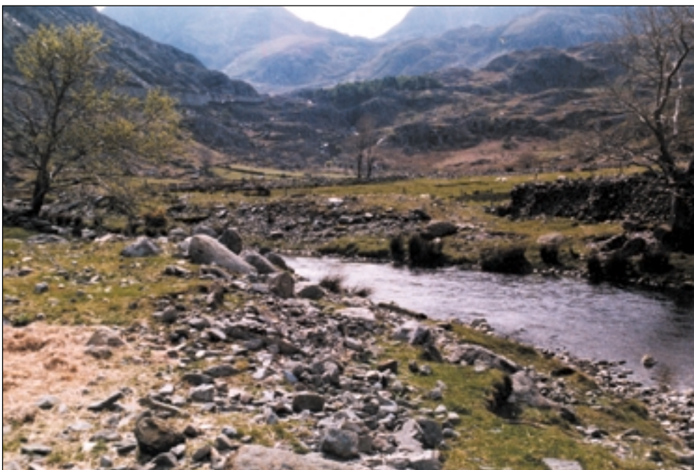
View across the deepened river at the old ford location