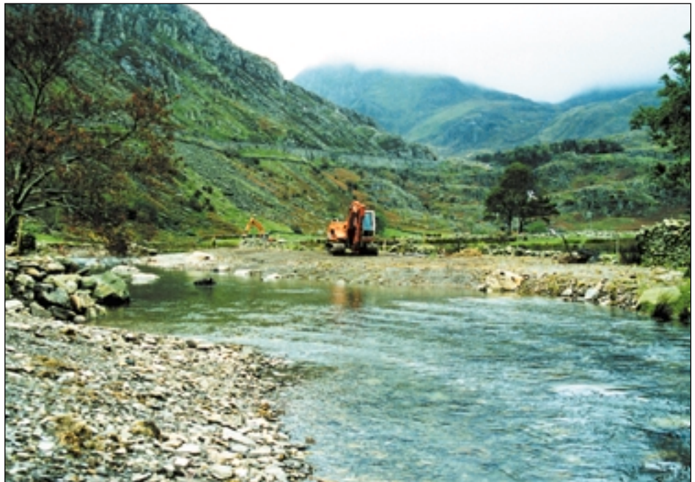
The restored ford, shoals and riverbed

The ford is located between two opposing bends in the river alignment such that shoals of gravel naturally accumulate on the inside of each. The two shoals would typically be joined by an underwater bar of gravel aligned diagonally across the channel. The natural cross-section of the river, drawn across this diagonal bar and up the flat shoal profiles each side, would roughly match the ford profile needed. The sustainability of the shoals and the bar of gravel would depend upon continuing inputs of material to