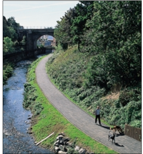
Bitmac footpath towards Skerne Railway Bridge

Drainage of rain water from adjacent slopes proved critical and some remedial works were needed to clear occasional puddles and associated silts that mudded the path.