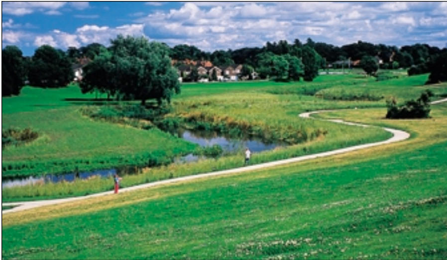
Concrete footpath and meanders

COST – Concrete path £55k, Bitmac path £43k