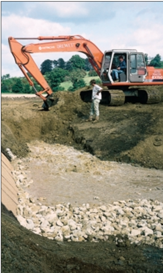
Construction of coir matting revetment – river being released

Coir was installed on both banks at the crossing located mid way between the ford (ch. 280m) and the stock bay (ch. 100m), as well as opposite the large backwater. Hurdles were installed opposite the small backwater. A plan of the reach can be found in 1.2.