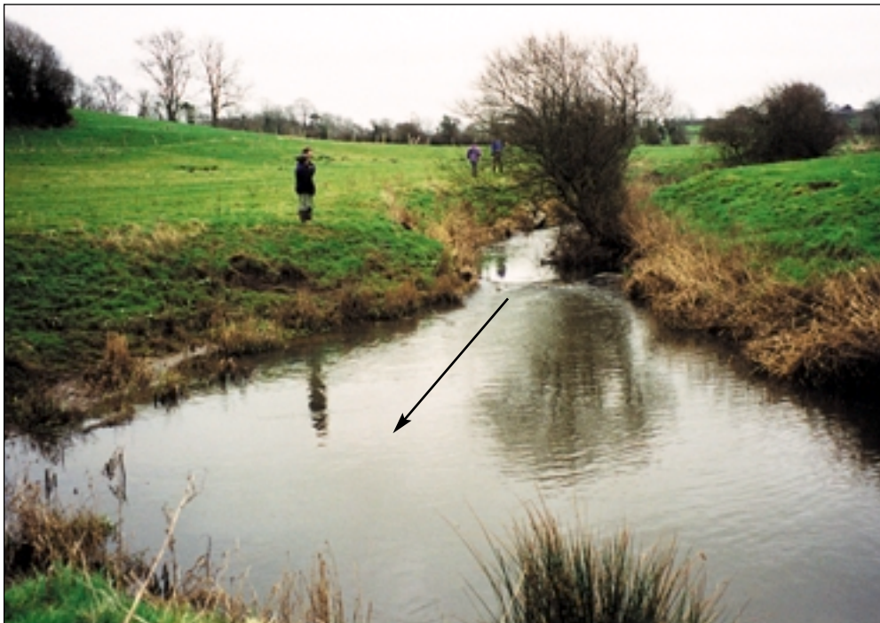
Bay 1 showing the angle of flow keeping the bay 'open'

the water's edge, but the stocking densities are low enough not to be of concern. Grazing maintains a cropped but diverse macrophyte margin.