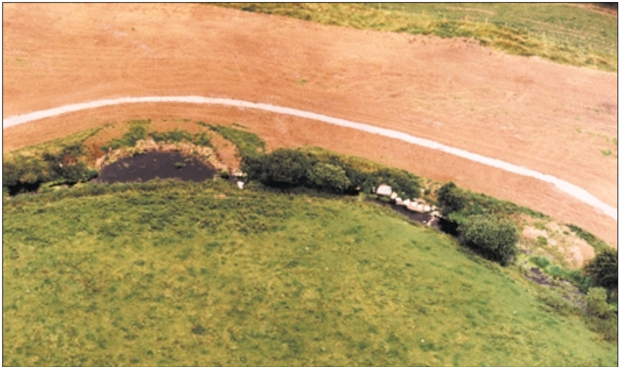
Downstream bays after less than a year. Note: Bay 2 is already becoming choked with vegetation

From the ledge the bank rises at a batter shallower than the existing 1:1 bank (approx. 1:2 to 1:3). The batter angle varies with the difference between bed and bank top (from 2 to 4m) (figure 3.8.2).