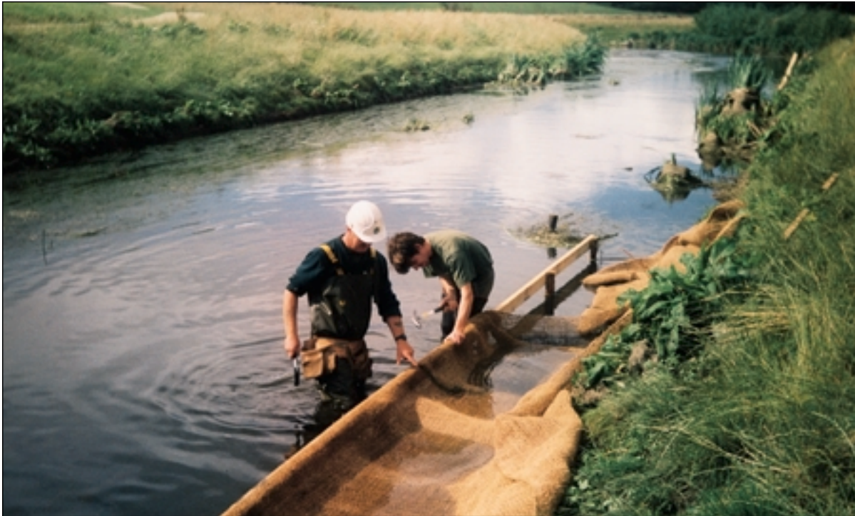
Attaching coir matting to create Type A ledges on River Skerne

COST – Type A – £45 metre, Type B – £40 metre