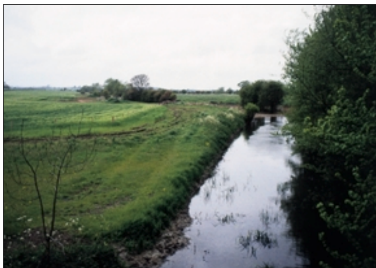
Prior to re-profiling and ledge construction – May 1996