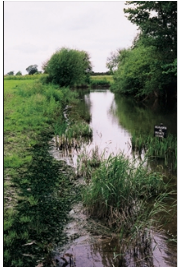
Type A and B ledges on the Cole after one winter

The ledges overwintered well in dormant conditions with no structural damage by floods although little more than 50% of the plants appeared to have survived to grow on during summer. The ledges are developing very well (1998) and creating both emergent vegetation habitat and landscape enhancement in the short stretch of river that previously had the least habitat and visual amenity value.