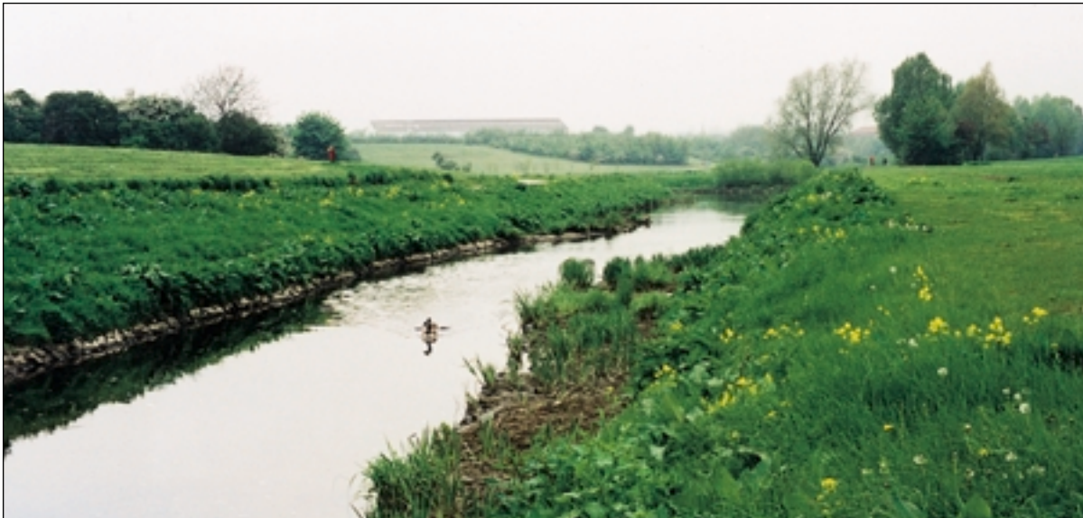
SUBSEQUENT PERFORMANCE 1996/8

Type B margins utilising plant rolls were installed upstream of the footbridge in August 1996. In 1998 they are attractive features much favoured by resident ducks that have created some bare patches between well established runs of lesser pond-sedge, yellow flag and reed canary-grass. The attraction of silt within the overwinter dormant vegetation along the ledges is significant; ledges have built up by as much as 300mm in places before being assimilated within new spring growth.