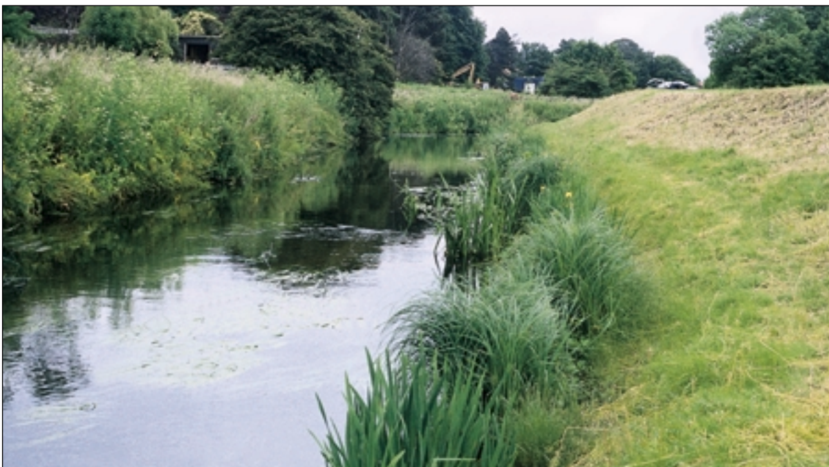
Type B Ledge on the Skerne after 2 years

Type A margins using plant pallets were installed downstream of the footbridge in the autumn of 1997 and overwintered satisfactorily in dormant conditions after several floods. Early summer 1998 growth was patchy with some silt banks smothering pallets. Growth was sufficient to ensure the spread of species to generate the dense cover required. Notable species that survived include occasional purple loosestrife and meadowsweet.