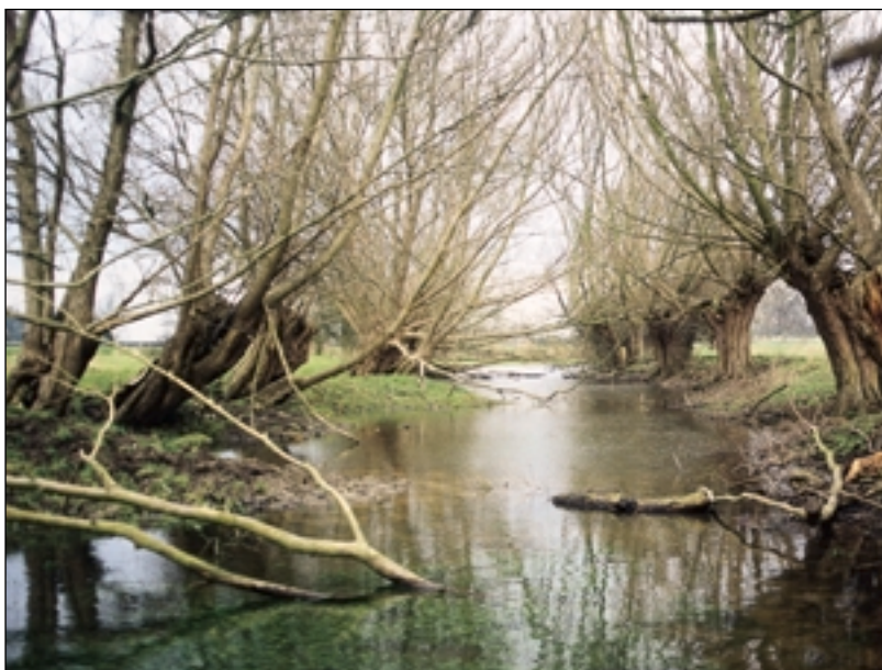
Remnant of meander – pre-works – January 1996 (shallow water held temporarily after heavy rain/flooding).