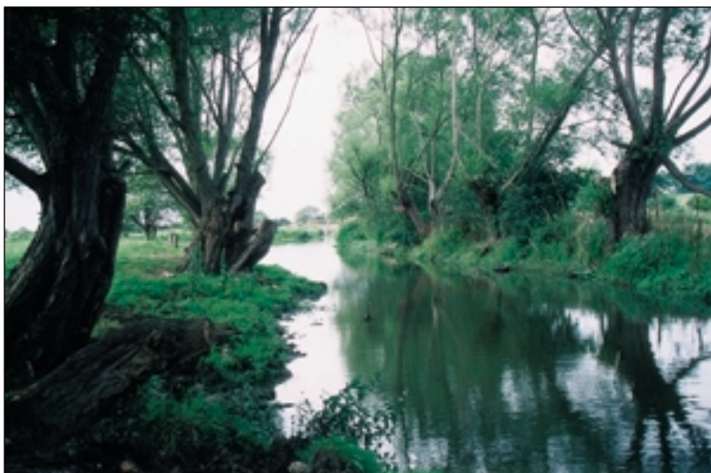
Re-excavated meander – Autumn 1997