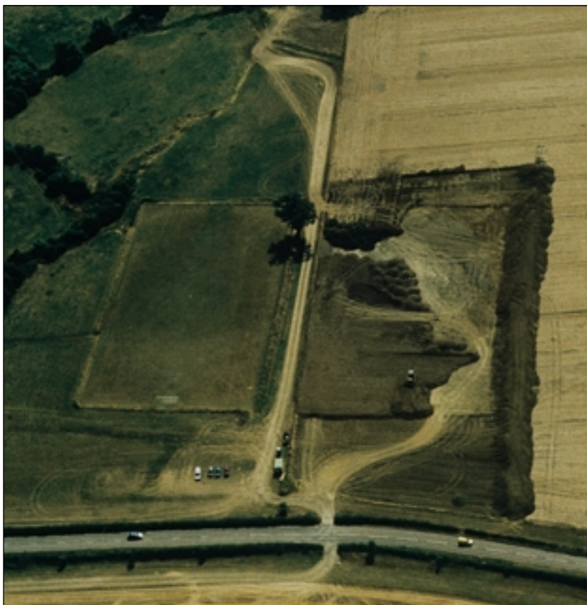
Construction of landform in arable field to right of football pitch – 1995

The concept of re-profiling valley sides near to the floodplain has proved to be a very effective way of avoiding excessive spoil disposal costs without any obvious detriment to the landscape.