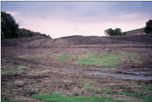
Keepsafe landform during construction

The creative use of spoil in this beneficial way has overcome what would otherwise have been a prohibitively expensive operation of carting off site.