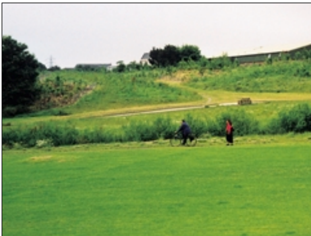
Similar view of Keepsafe after tree planting – 1998