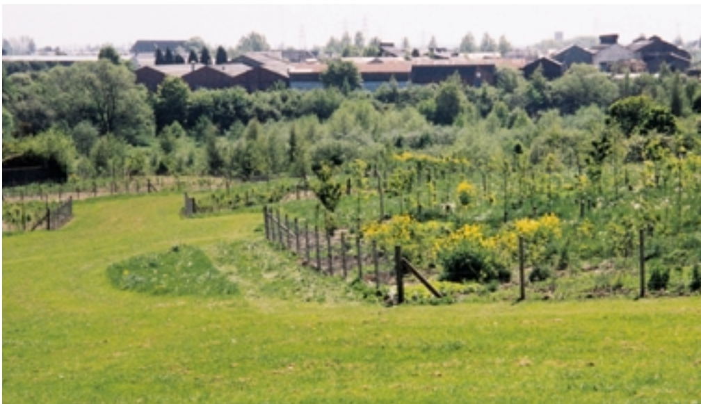
Rockwell after landform completion – 1998

COST – £60k Carting and creation of landforms